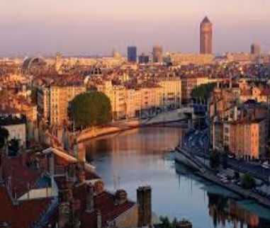
A beautiful site of Lyon with the Saône River passing through the city.