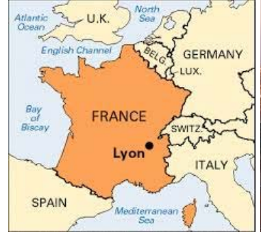
Map of France, showing Lyon, the site of PPS-32 International Conference.

Lyon is a city in France's Rhône-Alpes region and it is the culinary capital of France and the world, home of the famous French chef Paul Bocuse and more. It sits at the confluence of the Rhône and Saône rivers. Its city center reflects 2,000 years of history, with a Roman amphitheater in Fourvière, medieval and Renaissance architecture in Vieux Lyon, and the modern, redeveloped Confluence district on the Presqu'île peninsula between the rivers. It has a lot to offer to all those people interested in the history and cultural activities for which France is so well renowned.